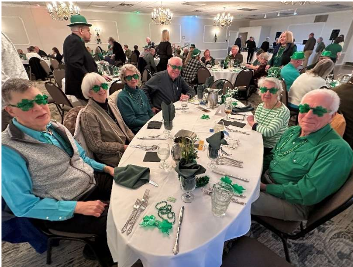
Some of the Guests at the St. Patrick's Day Party