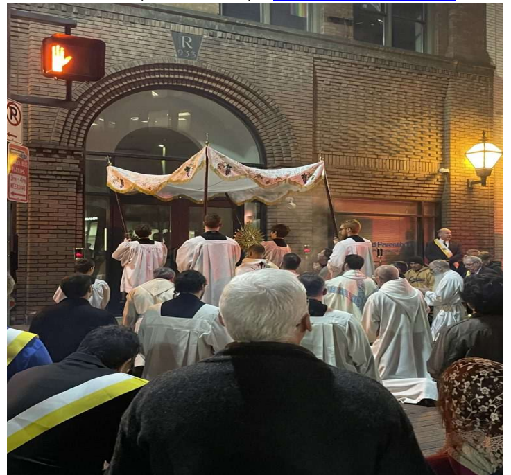
Eucharist Procession at Planned Parenthood

Life Director (724-799-0249) & chris081476@gmail.com