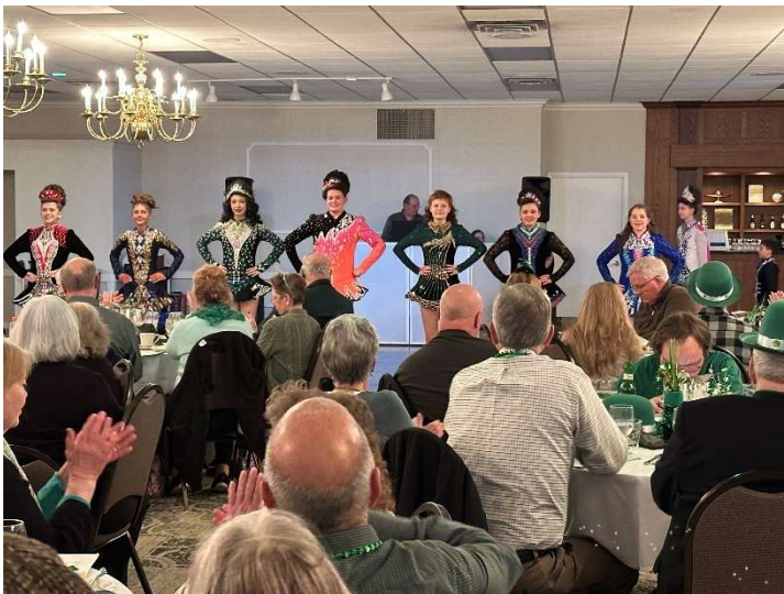
Some of the Dancers from Bell School of Irish Dance