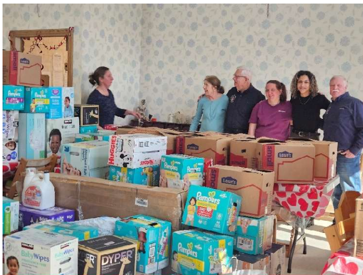
Staff and Knights at Angels' Place - March 4 th