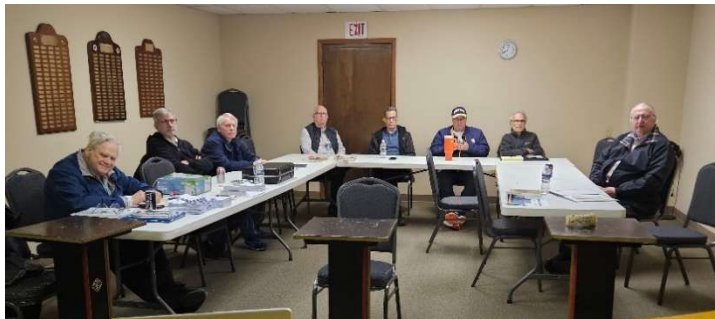
COAL / St. Patrick's Day Mailing Team

Please Sign-Up as Soon as Possible: (New or Original Rooms Available) (St. Paul's 412-381-7676) 8am-4pm M-F