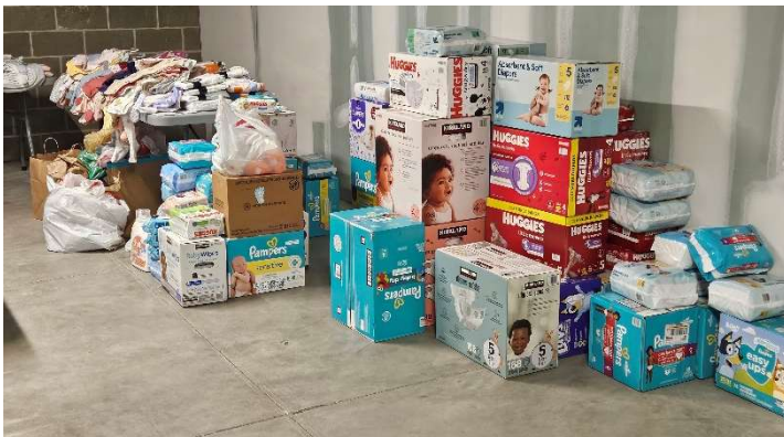
Partial Collection of ASAP items at St. Aidan Parish