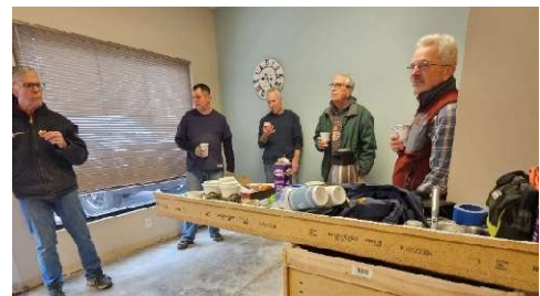
Fellowship after the demo work.