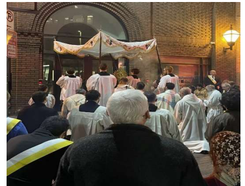
Eucharistic Procession Planned Parenthood