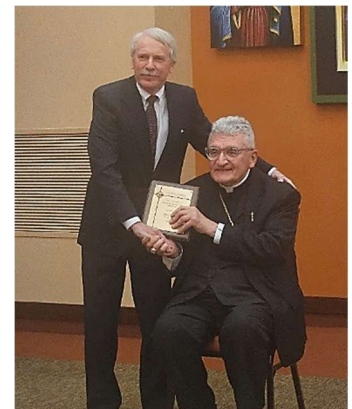
Bishop's Project Dinner