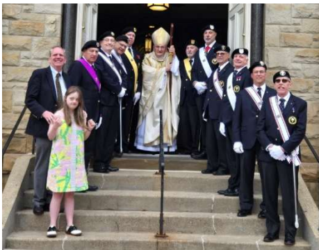
Three Rivers Mass