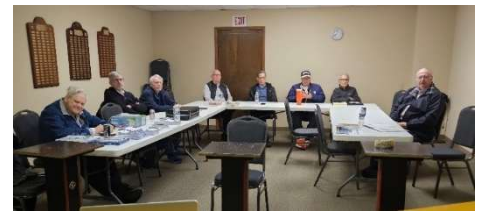
St. Patrick Day Envelope Stuffing