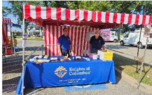
St. Aidan Festival