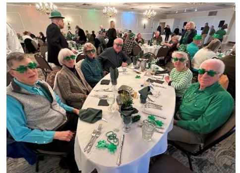
St. Patrick's Day