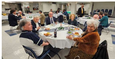
Memorial Mass Repast