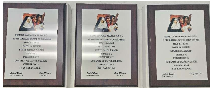
Faith In Action Awards: Family, Faith and Life

Our Council has been asked to support the upcoming Corpus Christi Procession scheduled at St. Aidan's Parish, Sunday June 22 nd , following the St. Alphonsus 11:30AM Mass. The procession will proceed along Perry Highway to the St. Alexis Church.